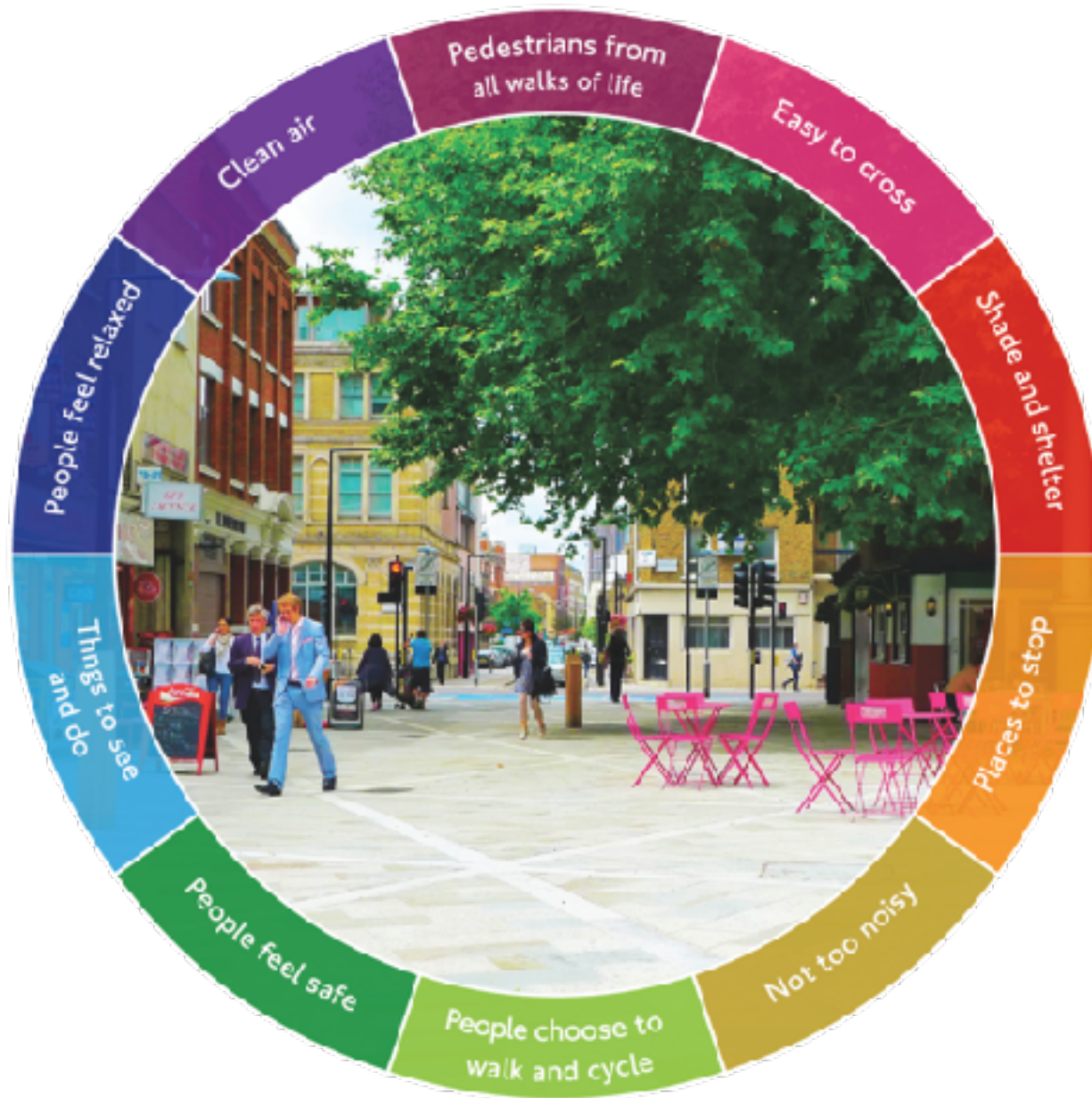
‘Healthy Streets Approach’ Lucy Saunders for Transport for London