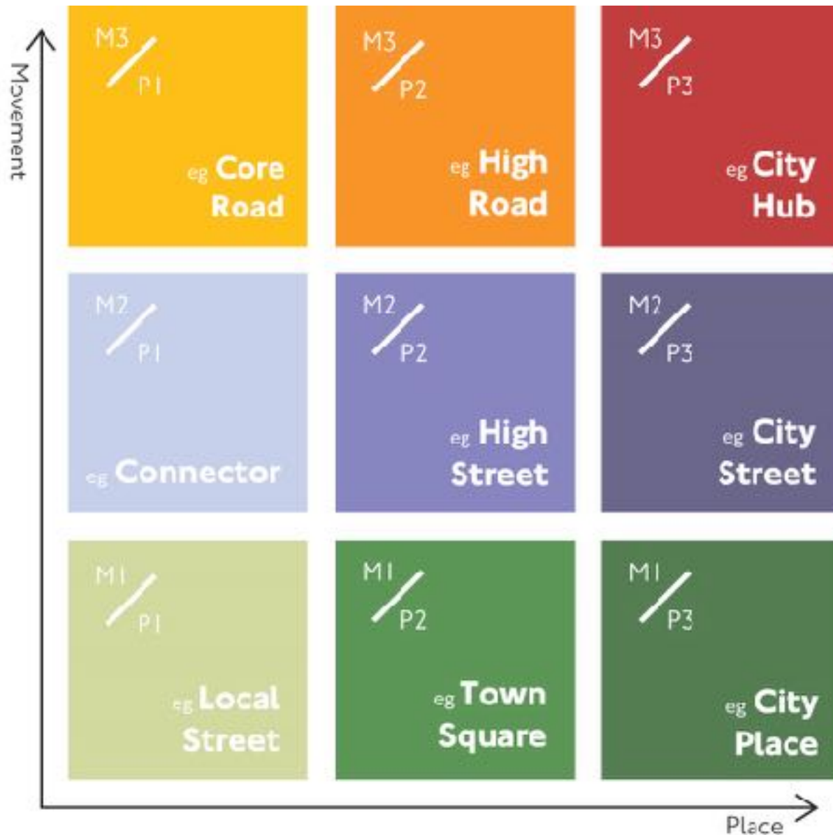
‘London Street Matrix’ Transport for London